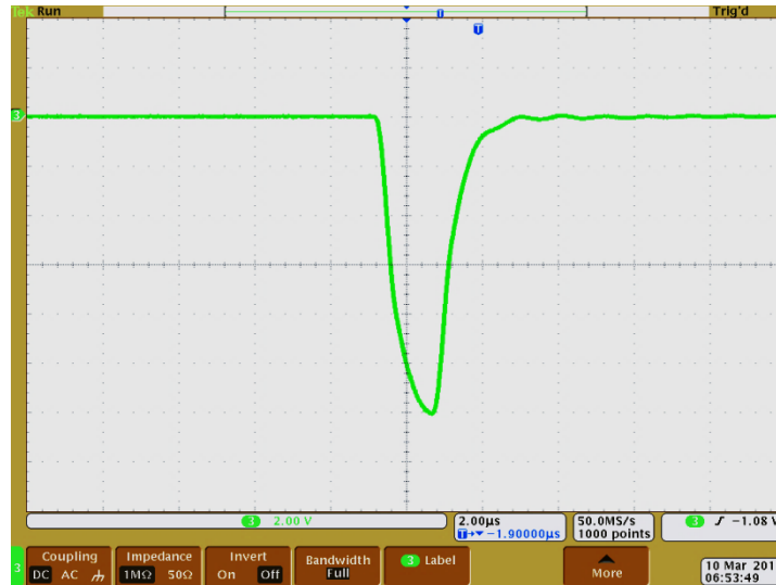
Figure 2. Conditions at DRV3205-Q1 Pin for -12-V Pulse Train