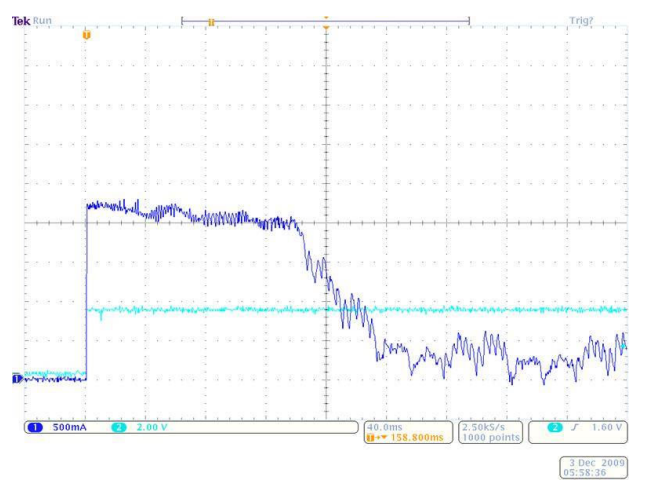
Figure 1. DC Motor Current vs. Time

In Figure 1, current is plotted versus time depicting the startup profile for a brushed DC motor. In this case, current is limited to approximately 2 amperes before the motor reaches a steady state condition of less than 1 ampere. Without current regulation, this same motor peaks to over 14 amperes. This not only requires an over-designed power supply to support this transient, but the motor driver also needs to be rated to reliably handle the peak currents.