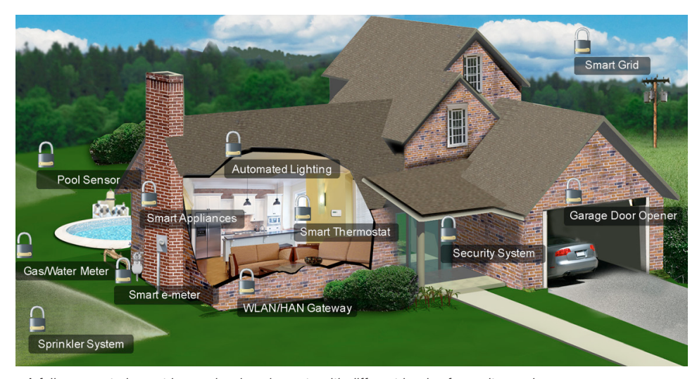
A fully connected smart home showing elements with different levels of security needs

Each link requires different levels of security and is subject to different types of threats or attacks. There is no single approach to securing an application, and the methods as well as their complexity vary depending on the element that needs to be secured as well as the criticality of the information. This paper identifies threats and offers risk mitigation methods for a portion of the system, in this case the sensor nodes that are typically driven by a microcontroller. An example of this can be temperature or lighting control elements, a remote garage-door opener and other similar home automation nodes. A microcontroller is often at the heart of these nodes and depending on the application, the process of closing the security gaps may vary.