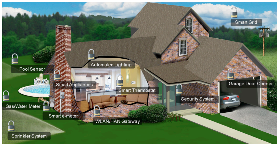
A fully connected smart home showing elements with different levels of security needs

Each link requires different levels of security and is subject to different types of threats or attacks. There is no single approach to securing an application, and the methods as well as their complexity vary depending on the element that needs to be secured as well as the criticality of the information. This paper identifies threats and offers risk mitigation methods for a portion of the system, in this case the sensor nodes that are typically driven by a microcontroller. An example of this can be temperature or lighting control elements, a remote garage-door opener and other similar home automation nodes. A microcontroller is often at the heart of these nodes and depending on the application, the process of closing the security gaps may vary.