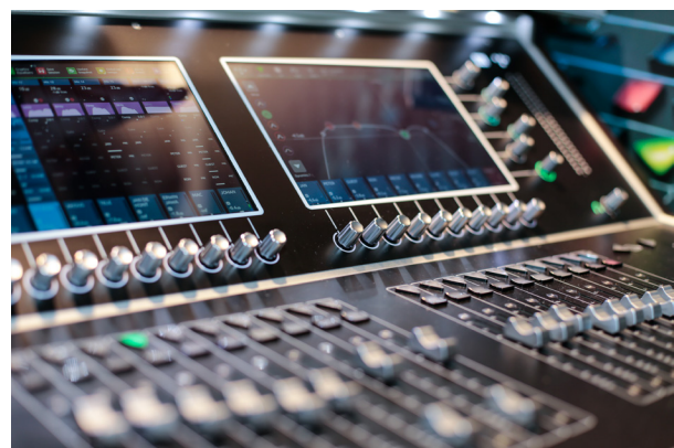
Figure 3. Example of a traditional mixer (a); example of a touchscreen mixer (b).