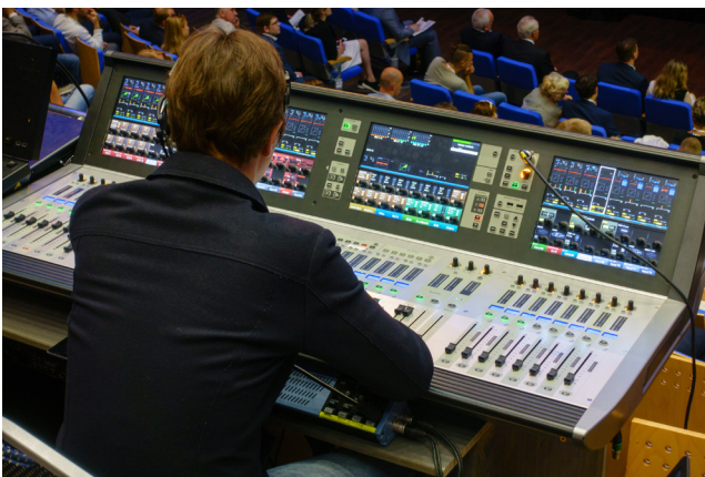
Figure 1. Digital mixing console in use at live event