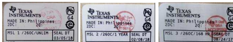
Figure 2. MSL 1,2,3 Rating and Peak Reflow Labeling Examples on Cardboard Box