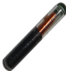
Figure 1-1. TRPGP40ATGC Transponder