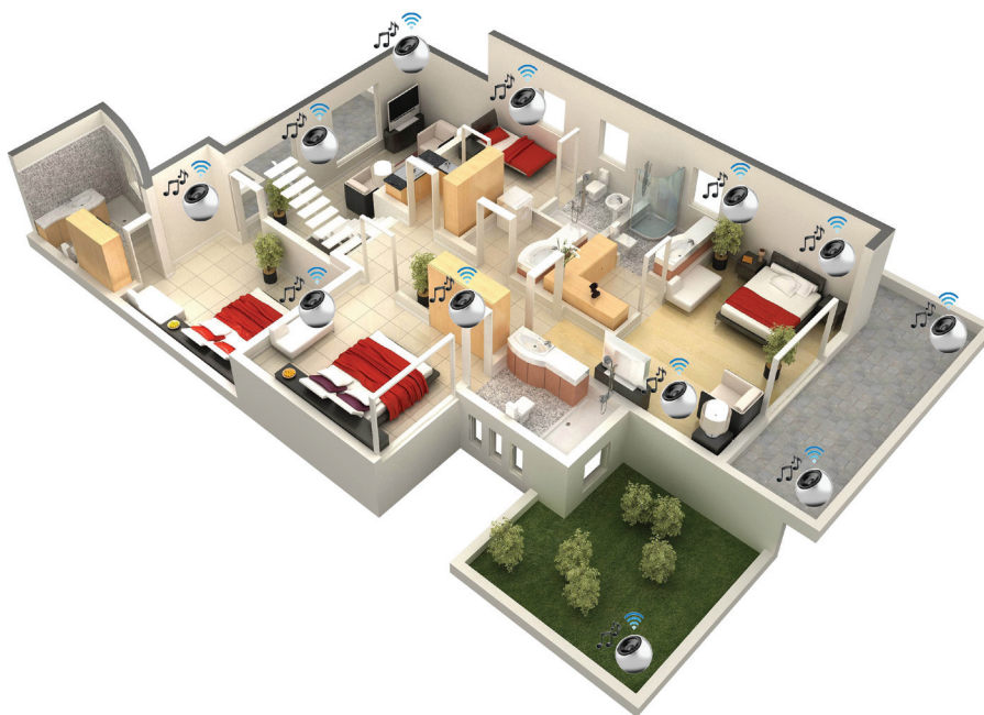
Figure 2: Wireless multi-room audio streaming

This type of solution opens up a new range of new issues, such as latency, routing and network management, speaker discovery issues, etc. For this use-case—a more advanced and efficient networking model is required.